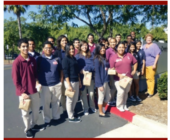
Preuss students visit Jack in the Box headquarters.

Transportation is just the beginning of Jack in the Box's generosity. The company has also offered one-of-a-kind, hands-on learning experiences for Preuss students and created scholarships for Preuss graduates who attend UC San Diego. Many of their employees are Preuss volunteers as well. We are truly grateful for Jack in the Box's loyal support.