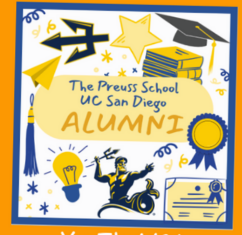
Vy Thai '24 Button Design