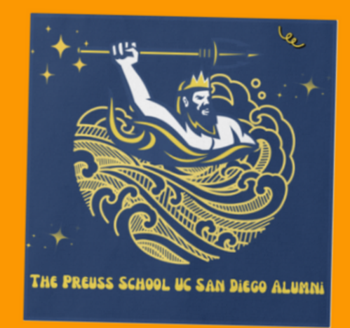
Aklesia Mekuria '24 Tote Bag Design