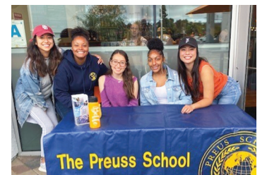
The Preuss School students partnered with the local breakfast eatery Snooze for their annual fundraiser

Thanks to a longer learning time, students are in school longer each day and for 18 more days a year than the typical student in California, which adds up to almost an entire extra academic year over the course of their middle and high school careers. Our scholars are accepted to four-year colleges and universities at a rate of more than 90 percent, and almost 100 percent go on to some form of higher education.