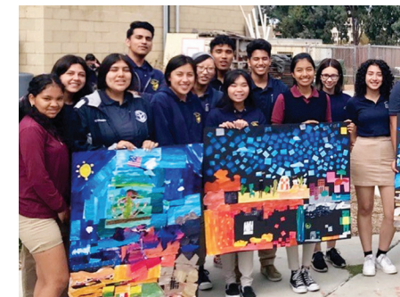
The Preuss School students posing with their plein air paintings