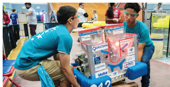
The Preuss School's new Fabrication Laboratory (FabLab) was launched this fall